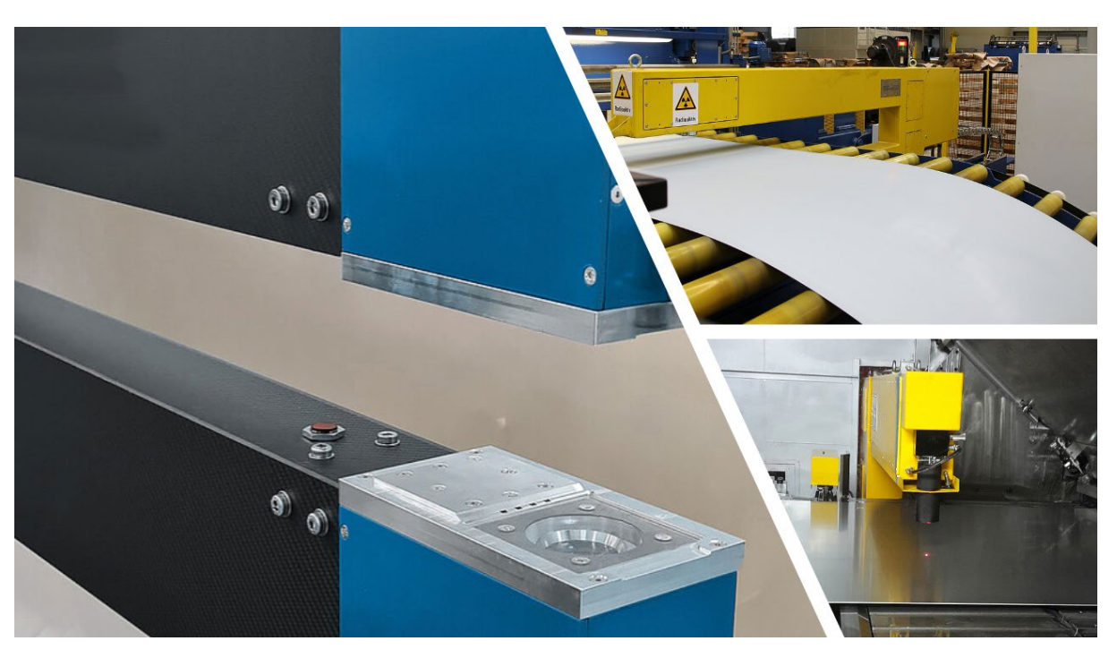
Three sensor technologies (clockwise: laser, isotope, x-ray) and plenty design concepts for EMG iTiM thickness measurement systems

Each technology has its own specific advantages and disadvantages, and in the end, it is the application that determines the selection or even the most appropriate combination of measurement methods.