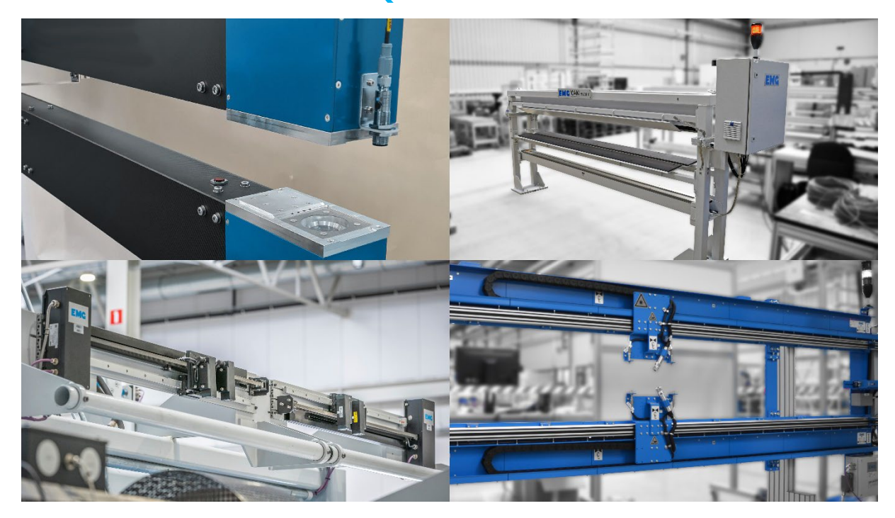
EMG QA systems for SSCs clockwise; EMG iTiM, EMG iCAM®, EMG SOLID®, EMG BREIMO